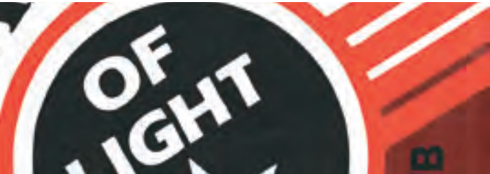
pg 9 Chariots of Light 2012