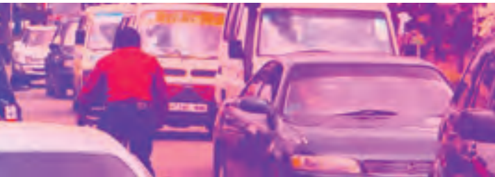
pg 12 The Power of Now