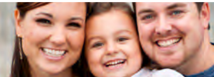
pg 14 The Loving Family