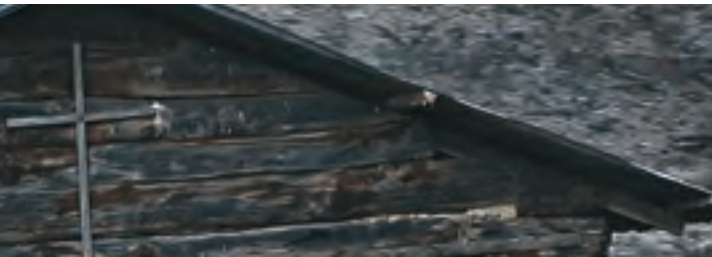
pg 4 Developing A Vision For Increase