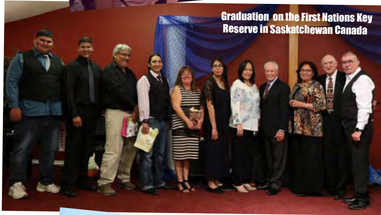
Graduation on the First Nations Key Reserve in Saskatchewan Canada