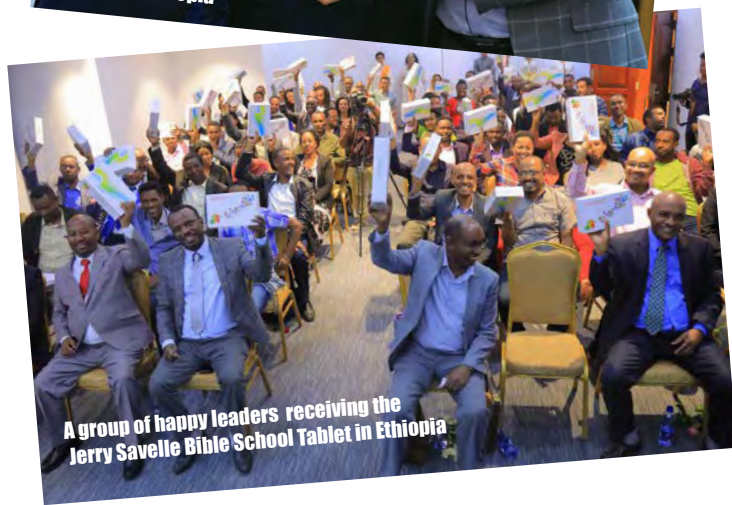
A group of happy leaders receiving the Jerry Savelle Bible School Tablet in Ethiopia